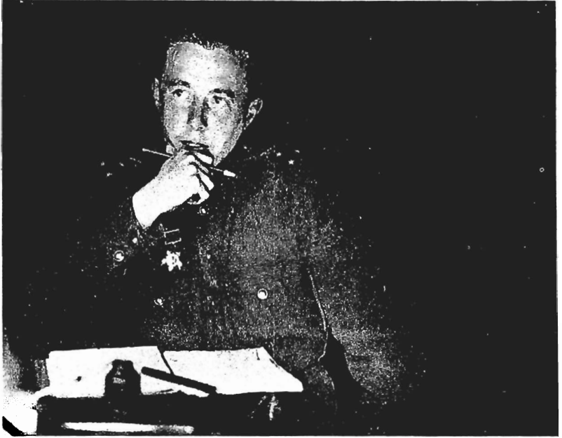
Aleksandr Isayevich Solzhenitsyn—in the army