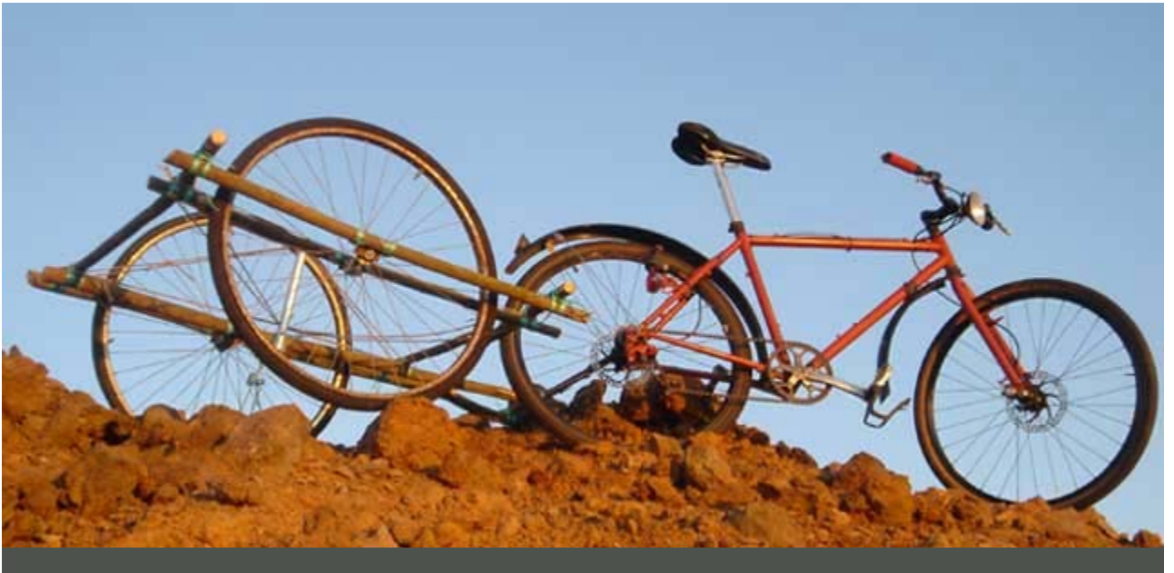
Carry Freedom gets their graphics done by done by Do Good Advertising

Aaron's $30 brazed conduit utility trailer This is the man who got the bamboo bicycle trailer rolling